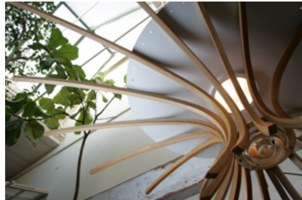
Ceiling Light for 40 Oaks by Brothers Dressler