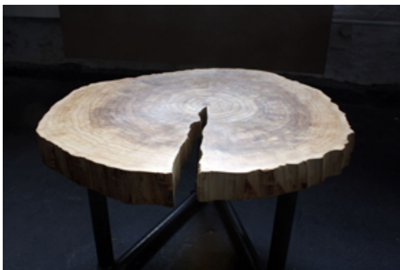
Log Table for 40 Oaks by C. Alves & K. Logan