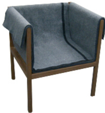
Chair for 40 Oaks by Heidi Earnshaw

All furniture produced is made from 80-90% reclaimed or reused materials. In order to celebrate the achievement of furnishing 40 Oaks in this groundbreaking method PDA will exhibit all the produced furnishings and design elements at 40 Oaks as part of the Toronto Design Offsite Festival between Friday, January 27 and Sunday, January 29, 2012. The exhibition Public Displays of Affection for 40 Oaks is free and open to the public. Shortly after the exhibition, all the furniture will be permanently installed. Many of the furnishings for 40 Oaks are still in production. Below are a few mid-production pieces. For more images contact Jeremy at jeremy@publicdisplaysofaffection.ca .